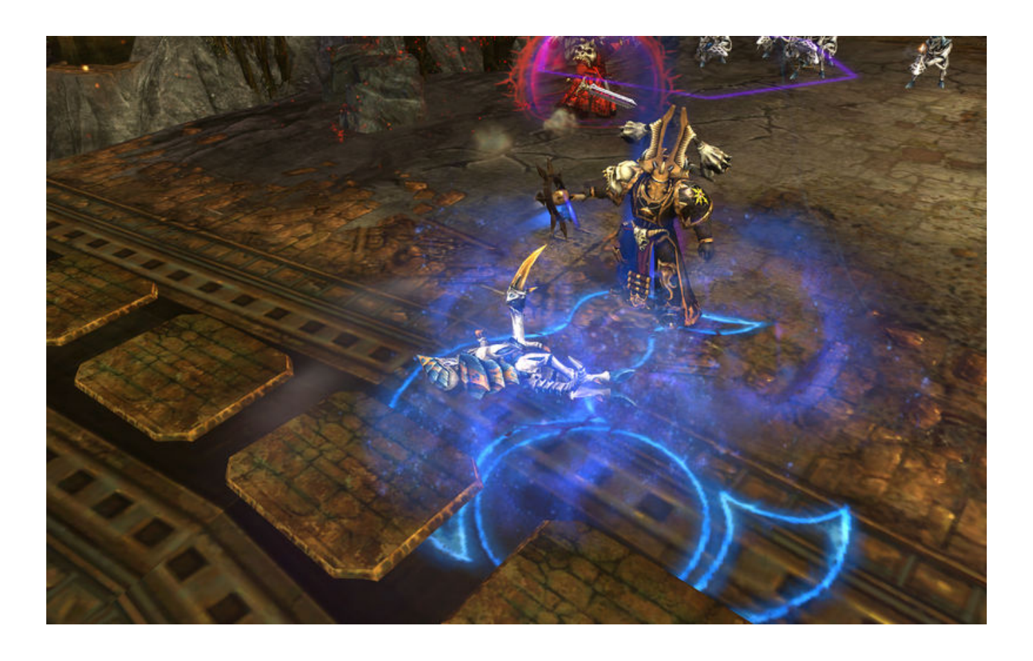
Download ->->-> <a href="http://bit.ly/2SLdLnj">http://bit.ly/2SLdLnj</a>

Warhammer 40,000: Dawn Of War II - Retribution - Chaos Sorcerer Wargear DLC Crack Activation Code Download